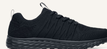
Everlight Black: 22272